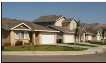
Rancho San Vicente 82 Unit Affordable Single-Family