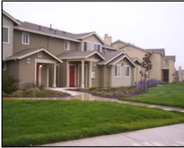
Market Street Townhomes 60 Unit Affordable Multi-Family Completion Date: August 2005